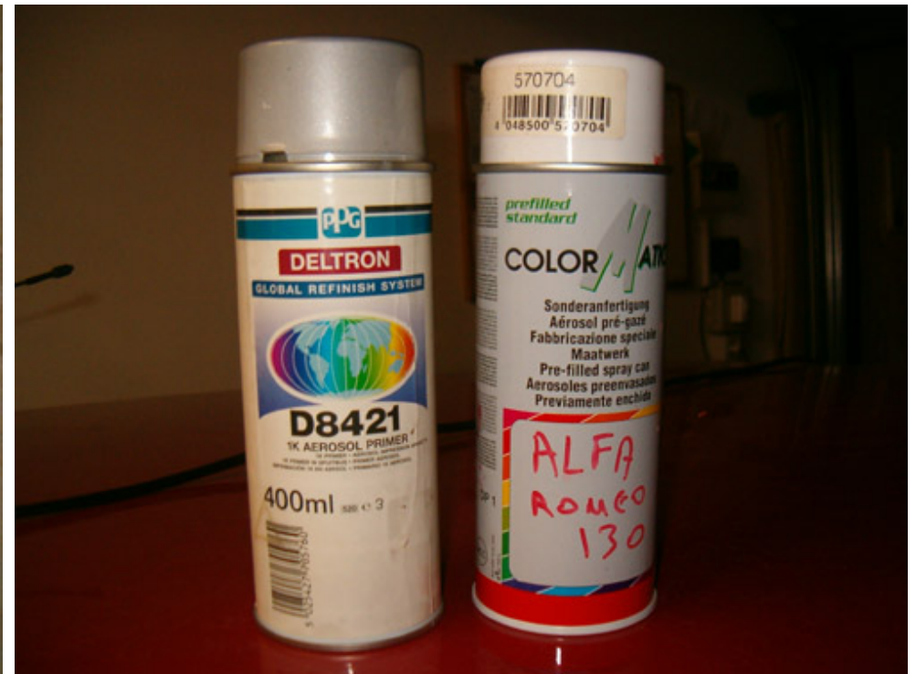
Primer and paint used in the repair.

A word for safety measures. Always wear protective glasses and activated carbon mask. During wire brush operation, wire elements are detached from the brush causing a serious potential to create injury. In addition, during painting always wear activated carbon mask in order to avoid inhaling hazardous gases contained in paint.