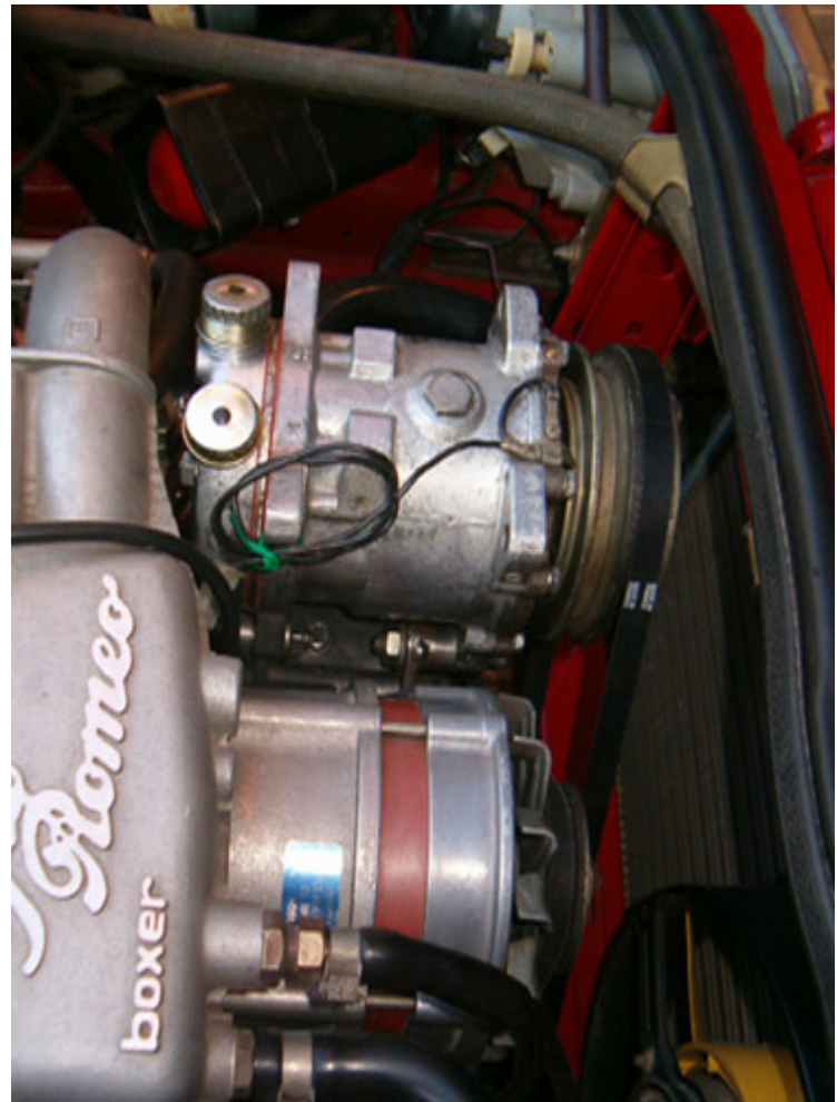
From another angle.