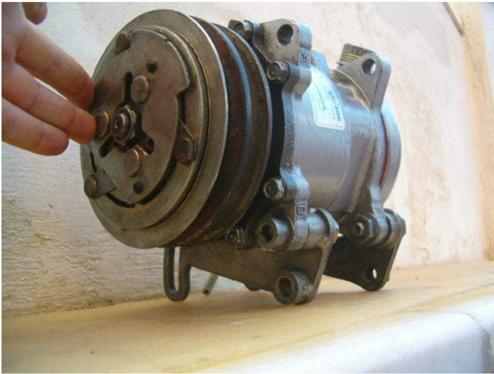
Right before installation on engine compartment.