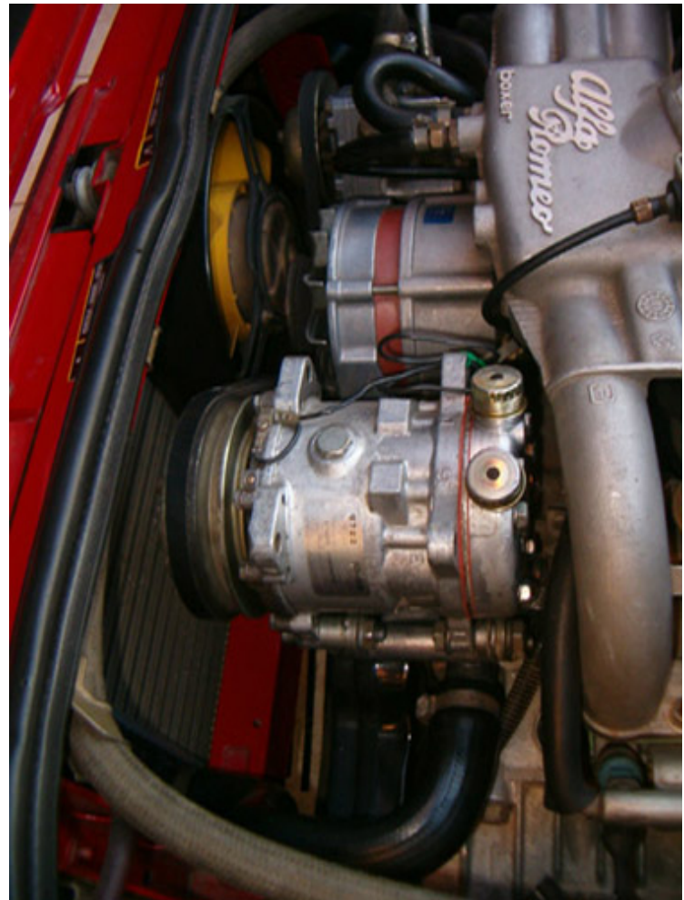
Compressor just installed along with driving belt (part number 60548814)