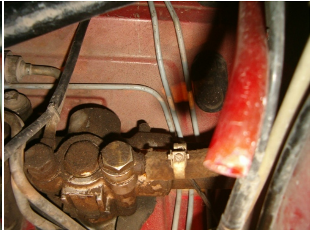
The arrows indicate the right front wheel solid brake line